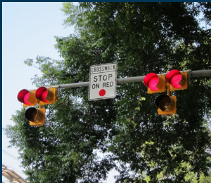
Example of PHBs mounted on a mast arm.

reduction in fatal and serious injury crashes. 3