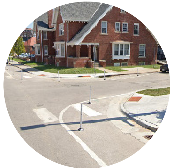
Ex: Painted Curb Extension