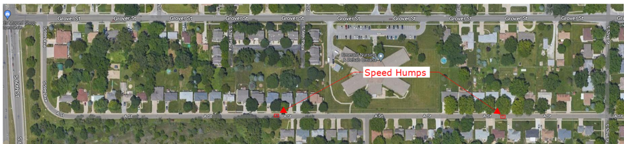
“A” Street Speed Humps

The City of Omaha selected The Schemmer Associates (Schemmer) to be the onsite representative and provide construction administration for this project. The project will consist of removal of existing surfacing, grading, removal of trees and shrubs, construction of new storm sewer, water main, and segments of sanitary sewer, and paving of the street and driveways. We anticipate the work will begin with tree removals on March 20, 2023 . The remaining work will be completed in 5 phases. Road work will start on March 27, 2023 with installation of speed humps on A Street to discourage speeding during construction of Grover Street: